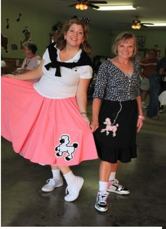
It's Sock-Hop Night!

The rally itself was marked by our normal great comradery and mischief. Impromptu road parties erupted periodically throughout our stay, but our hosts had arranged a full schedule for events that were not to be missed. Wednesday evening was Sock-Hop night which of course, had us eating chili and hotdogs. Thursday's continental breakfast was followed by a tour of the Culinary Institute of America and an evening of appetizers and desserts in the recreation hall. After Friday's breakfast there was a day at West Point and lunch at the famous Thayer Hotel. Friday evening was Italian night in the recreation hall with Lasagna as the main course. Saturday was a "relaxing" day where we had a traditional Nor'Easters full breakfast of omelets, pancakes, etc. followed by a business meeting, our "tech talk", a day watching old time airplanes and model airplanes fly at the Rhinebeck Aerodrome, and then a Pig Roast BBQ at