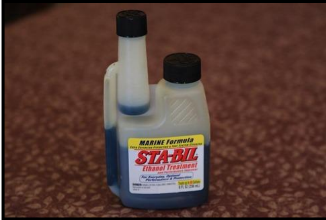
Example of Marine Stabilizer

In addition, new fuel does not have good lubricant properties, thus adding a supplement is also good practice for diesel fuel. If you use bio-diesel, Cummins recommends replacing the fuel filters as several people have experienced clogged filters.