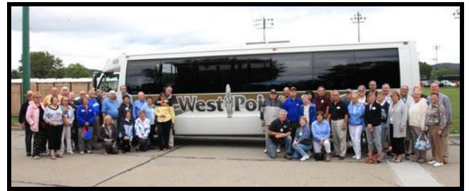
All Aboard for West Point

On Friday, 10 September 2010, the Nor'Easters went on an excursion to West Point. Cleverly enough, the military knew how to keep us to a schedule. We drove in car-pools to the West Point tourist center where we rapidly spread out to see the gift shop and various static exhibits.