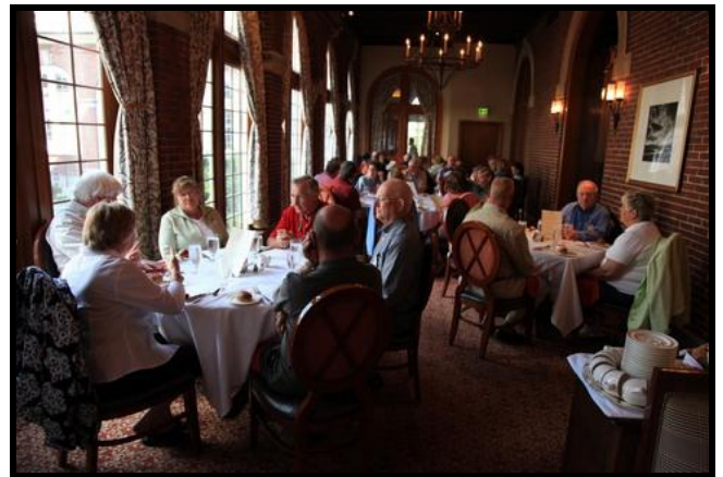
CIA "American Bounty Restaurant"

The classrooms were mostly large kitchens with picture windows to the hallways so that tourists (like us) could observe without disrupting class. We saw students making full meals. In fact, a bonus at this college is the meals made by the classes are consumed in the student eating halls. We also saw students making cakes, breads, cookies and candies. (And we were offered free samples!!!) You would think the students were all overweight but you would be wrong. They apparently really work hard to gain their degree. The whole trip made some of us think that we should be on the lookout for restaurants operating with talent from the CIA.